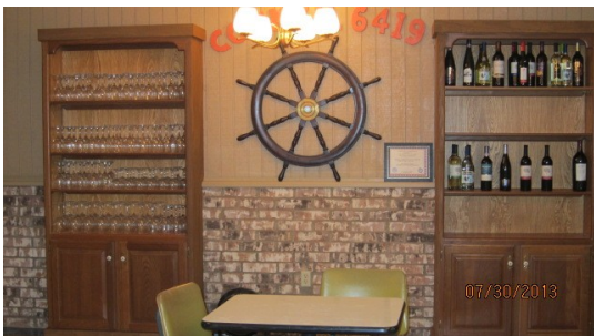
↑ New shelving in the bar room